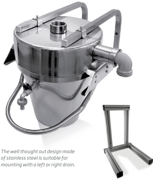
The well thought out design made of stainless steel is suitable for mounting with a left or right drain.