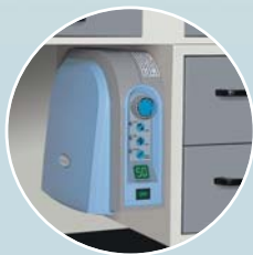
◀ Knee control style Mounting bracket for knee control